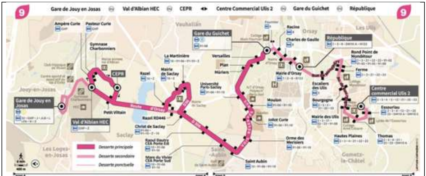
Fig 2. Line 9. The bus stops at “Orme des Merisiers”. In direction to Saclay, the next stop is Saint-Aubin. See http://www.transdev-idf.com/image/375736505/raw/ligne_mobicaps_9.jpg

In the evening, to go to « le Guichet » (check updated timetable on the panel close to the secretary office), use also the Public bus #9, stop: in front of “Orme les Merisiers”.