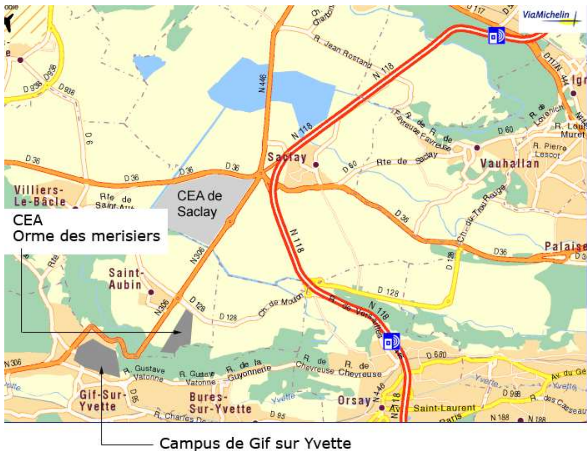
Figure 4a. Road Map around the Orme des Merisiers site of CEA Saclay.

There, follow the road straight away [50m] on your left, there are the buildings 703 (SPhN) and 709 (Sap) [see above Fig. 3 ]. You can park easily your car in the car park located close to the South entrance of the building 703.