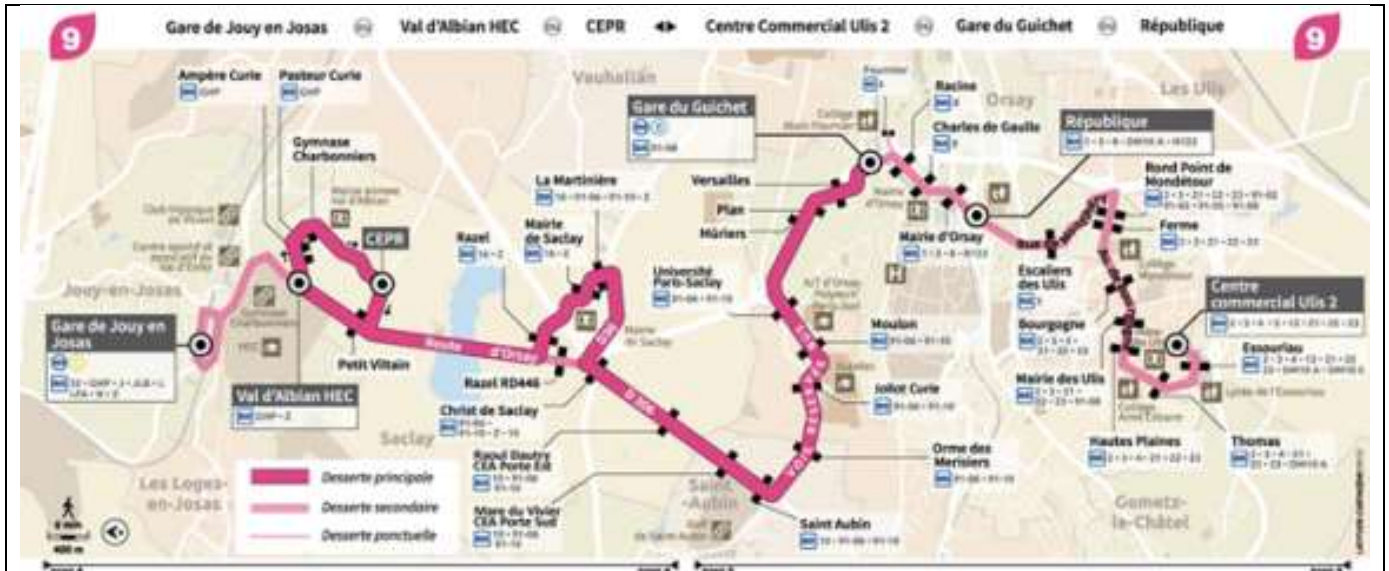
Fig 2. Line 9. The bus stops at “Orme des Merisiers”. In direction to Saclay, the next stop is Saint-Aubin.

In the evening, to go to « le Guichet » (check updated timetable on the panel close to the secretary office), use also the Public bus #9, stop: in front of “Orme les Merisiers”.