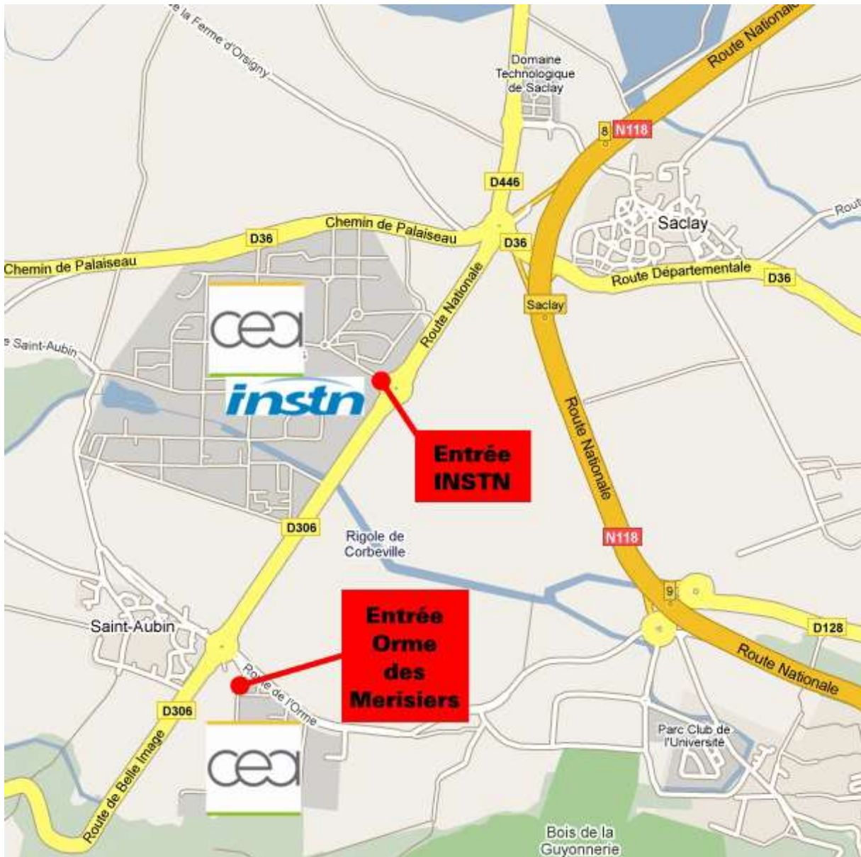
Figure 4b. Map: location of the CEA Saclay, INSTN, Orme des Merisiers.